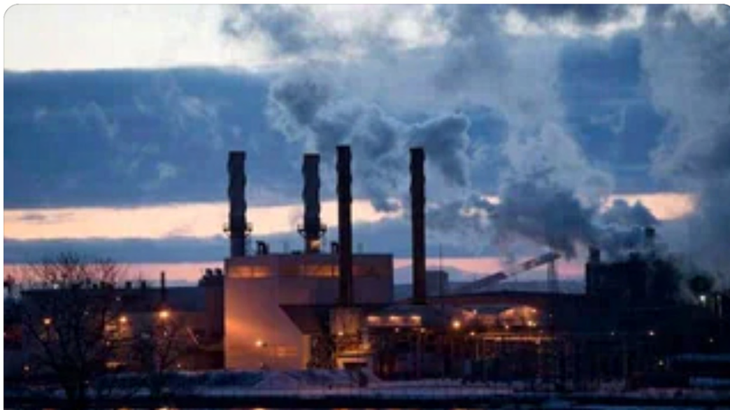
Reddit: Algoma Steel to get loans of $400m federally, $100m from Ontario as tariffs hit the industry. Read more here .